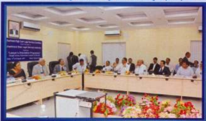
Hon'ble Judges and Other Judicial Officers at the Programme.