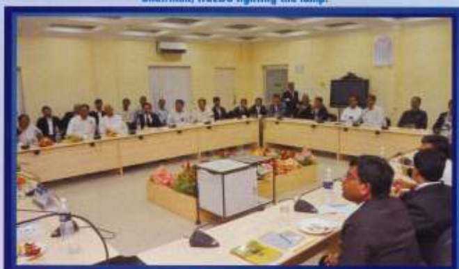
Hon'ble Judges and participants at Conference Hall during the programme.