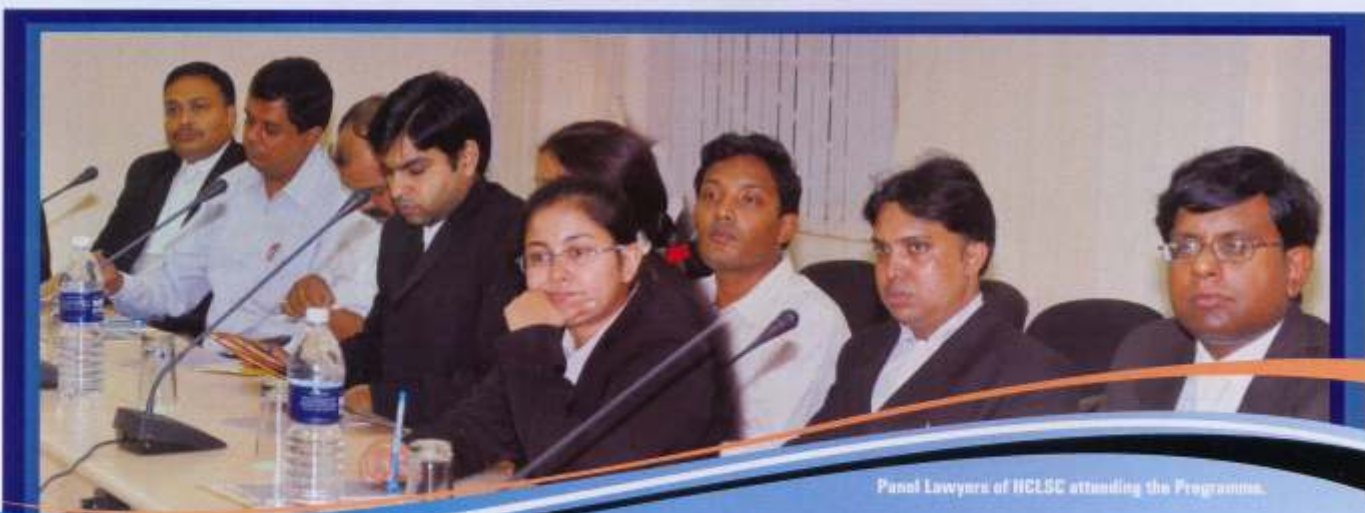
Panel Lawyers of NCLSC attending the Programme.