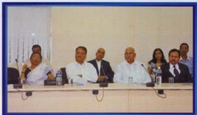
Hon'ble Judges & Other Judicial Officers at the Programme

The aims and objectives of the said programme was to ensure free, effective and competent legal aid to the persons approaching the High Court Legal Services Committee, Ranchi for legal services and to receive feed back of the panel Advocates and discuss about the difficulties being faced by them in espousing the concern of the litigants.