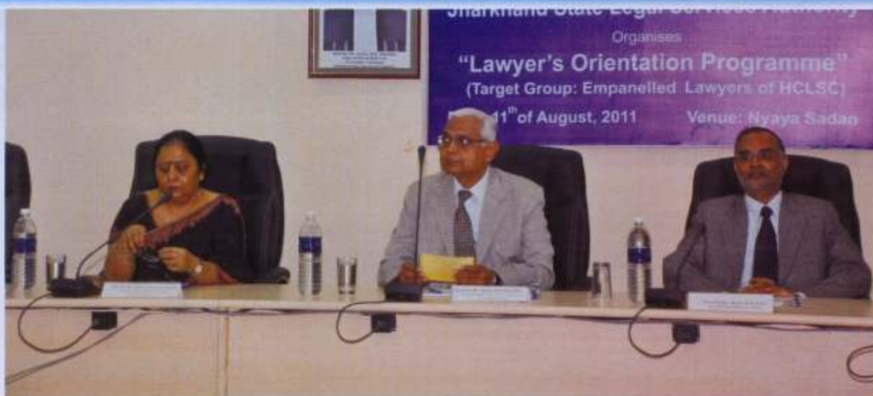
Hon'ble Dignitaries on the Dias.